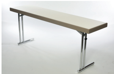
Size of the table in the booth: 180cm width X 40 cm depth

Find all info on catalogue on www.marevent.com . Click AE19 exhibitor section.